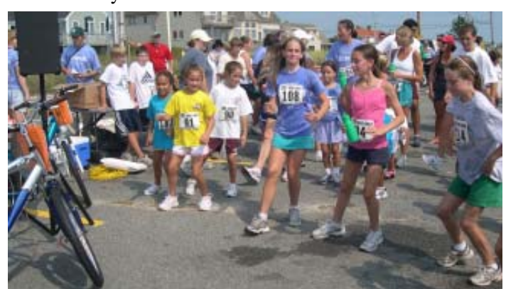
Boogying to the DJ after the Main Street Mile